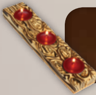
Waka Tealight Slab 3 Candles, Cranbury or Vanilla