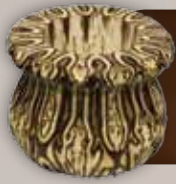
Rangi Small 50mm in height.