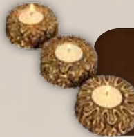
Tealight Candle Cranbury or Vanilla