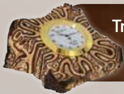
Tree Fern Wedge Desk Clock