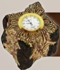
Tree Fern Cube Desk Clock