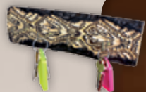
Rustic Key Holder 250mm long with 4 hooks