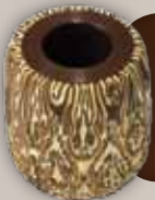
Tane Pot 100mm in height.