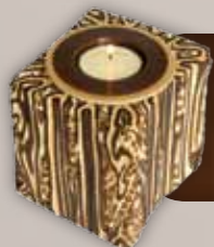
Warrior 100mm vase with T lite. Cranbury or Vanilla.