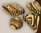
Assorted Fridge Magnets