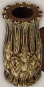
Elegant 200mm in height.