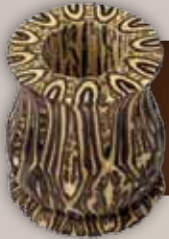
Petite Elegant 100mm in height.