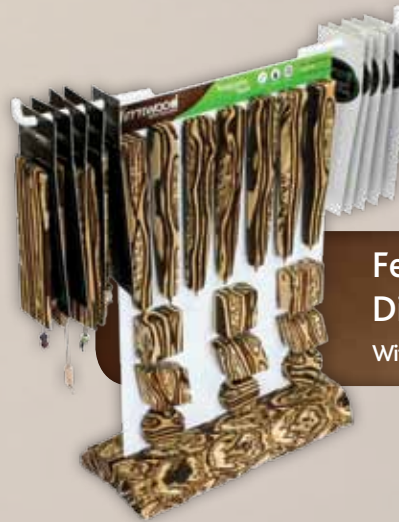
Fernwood Display Rack