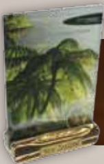
NZ Double Sided Photo Holder