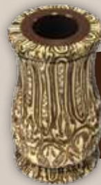
Grand 200mm in height.