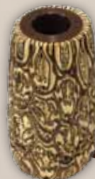
Smaller Taper 200mm in height.