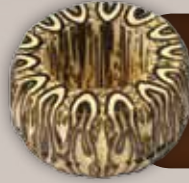
Koru Pot 50mm in height.