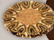
Single Ponga Coaster