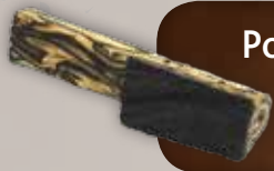
Ponga Iti - Memory Stick