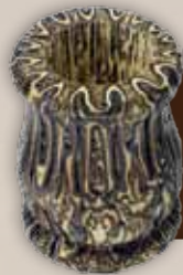
Papa 175mm in height.