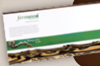
Picture Stick 210mm long