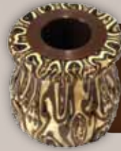
Rangi 100mm in height.