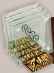
Ponga Coaster Holder and glass coaster set