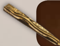
Ponga Pen with Magnet