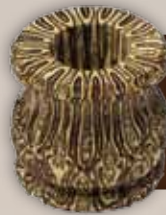
Papa 125mm in height.