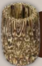
Squat 175mm in height.