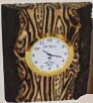
Tree Fern Wall/Desk Clock