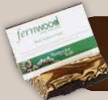
Business Card Dispenser / Passport Holder