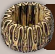
Koru Pot 70mm in height.