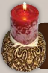
Scented Candle & Base Choice of four scents