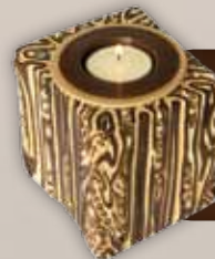
Warrior 140mm vase with T lite. Cranbury or Vanilla.