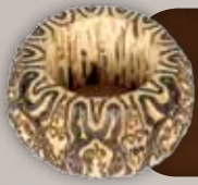
Mini Koru Pot