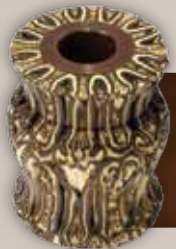
Curve 140mm in height.