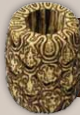
Petite Taper 100mm in height.